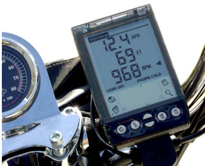
Figure 1 – Typical Handlebar Mounting

Additional mounting systems are available from Ram Mounts at www.ram-mount.com .