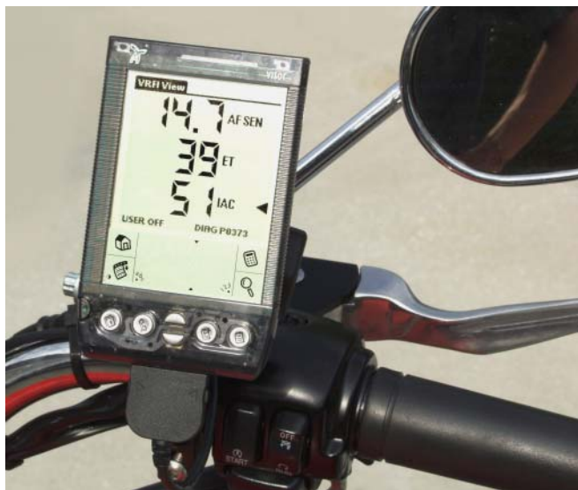
Figure 1 – Typical Handlebar Mounting

Additional mounting systems are available from Ram Mounts at www.ram-mount.com .