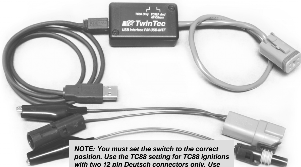
Figure 1 – Twin Tec USB Interface with Adapters

NOTE: You must set the switch to the correct position. Use the TC88 setting for TC88 ignitions with two 12 pin Deutsch connectors only. Use the TC88A setting for all other Twin Tec engine control modules and the Twin Tuner series.