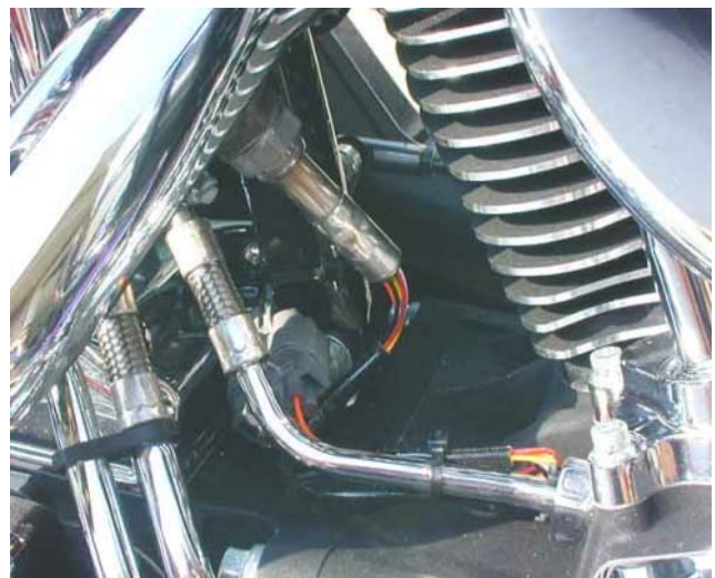
Figure 1 – Typical Sensor Installation