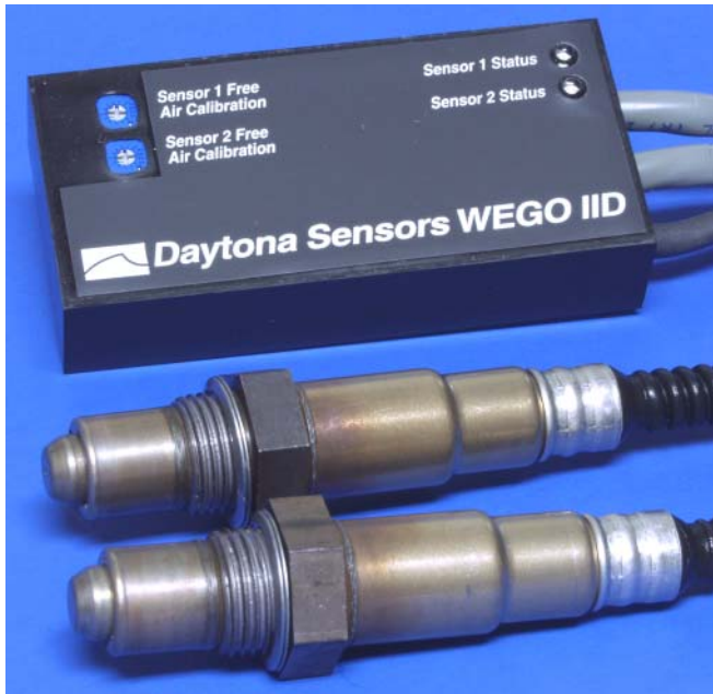
Figure 3 - WEGO Unit

The WEGO includes internal diagnostics for abnormal battery voltage (less than 11 volts or greater than 16.5 volts), sensor open circuit, and sensor short circuit conditions. A fault condition causes the status LEDs to blink at the slow rate.