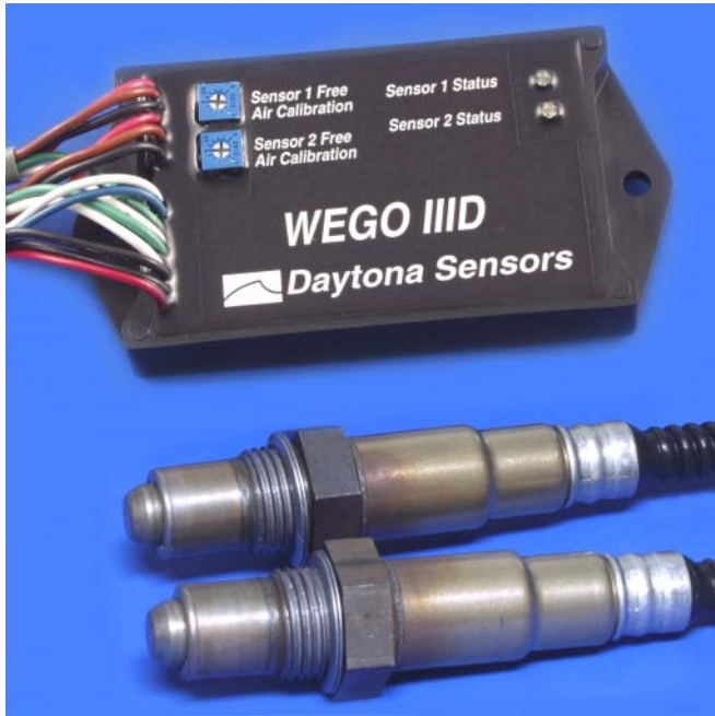
Figure 3 - WEGO Unit

The WEGO includes internal diagnostics for abnormal battery voltage (less than 11 volts or greater than 16.5 volts), sensor open circuit, and sensor short circuit conditions. A fault condition causes the status LEDs to blink at the slow rate.