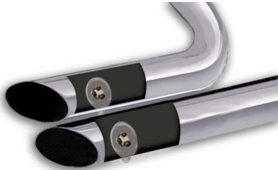
Figure 4 – Exhaust Mod to Reduce Reversion

Use washers with an OD that is 2/3 to 3/4 the ID of the pipe (for example, 1-1/2" OD washers are suitable for pipes with an ID of 2" to 2.25"). Weld ¼-20 socket head cap screws to the washers as shown. Drill holes at the bottom of the pipes about 2" from the end and use decorative acorn nuts to secure the washer assemblies. We suggest that you use stainless steel hardware.